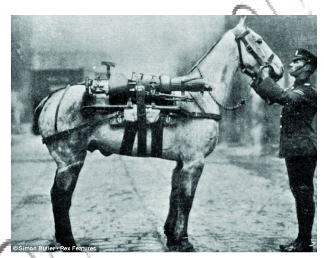
Mule carrying a machine gun

animal used in the war. Indeed, the writer, who has had experience of both horses and mules with a battery in two theatres of the war, would unhesitatingly say that if he had the remounting arrangements for any future war, mules would supplant horses to the greatest possible extent. Though for purchasing purposes mules in America have been divided at different times into several classifications, as a general principle mules may be regarded as being divided into three main categories—heavy mules for heavy artillery purposes in Eastern war theatres, light draught mules which have practically taken the place of horses in wheeled transport other than artillery, pack mules for pack transport.