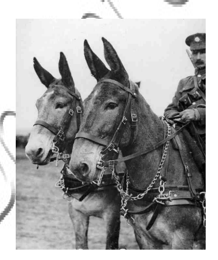
Mules at War 1916