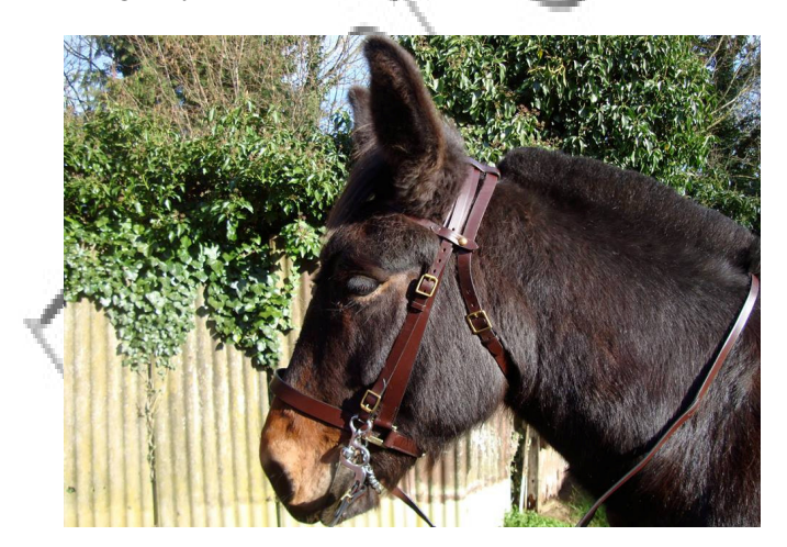
Military Bridle

In conclusion, it is only fair to describe a few of the sterling qualities of this often vilified and still more often caricatured animal. The mule is practically immune from many of the diseases inherent in the horse–notably he suffers less than half as much from shipping fever. He, as a general rule, has sounder legs than the horse. He can certainly stand more hardships. He eats less and is less particular about his food, though more particular about his water. He thrives on work. Great as has been the success of the American gun horse, still greater though perhaps less appreciated, have been the war qualities of the American mule. Long may he thrive!