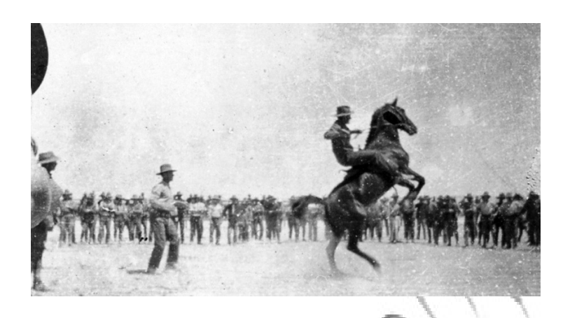
Although not at Lathom this contemporary picture shows the "Rough Rider" method of breaking horses.